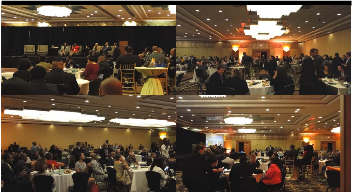
Politics is Business Workshop, Welcome Reception and Networking.