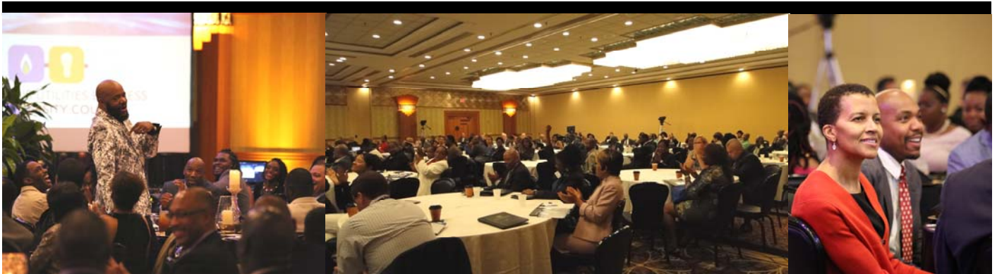
Various workshop sessions.